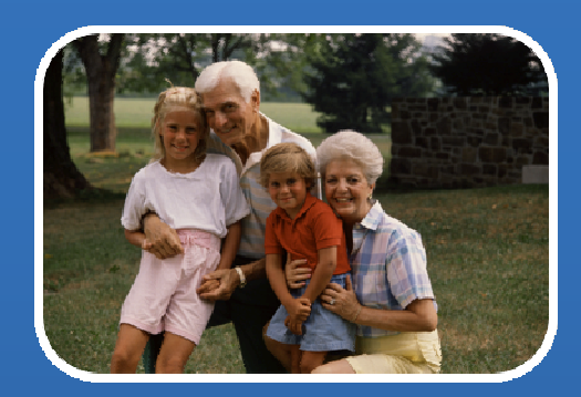
The Most Loving Thing You Can Do For Your Family

Heritage Living Trust was founded in 1989 to serve the needs of senior Americans. We have become the nation's most creditable Trust producer earning an A+ rating with the Better Business Bureau with zero client complaints verified by the BBB. Heritage is dedicated to producing the finest documents available and supporting a complete experience for our clients that includes, counseling, consultation, and trust funding support by providing free lifetime consulting and trust amendments for the life of every Living Trust. Heritage has set the standard for excellence in the Living Trust industry. It's the only company that does a complete job for you from start to finish.